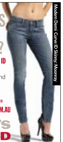
Modern Denim Curve ID Skinny Mooney